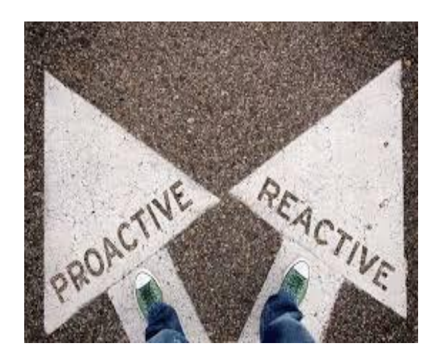
Proactive business referral